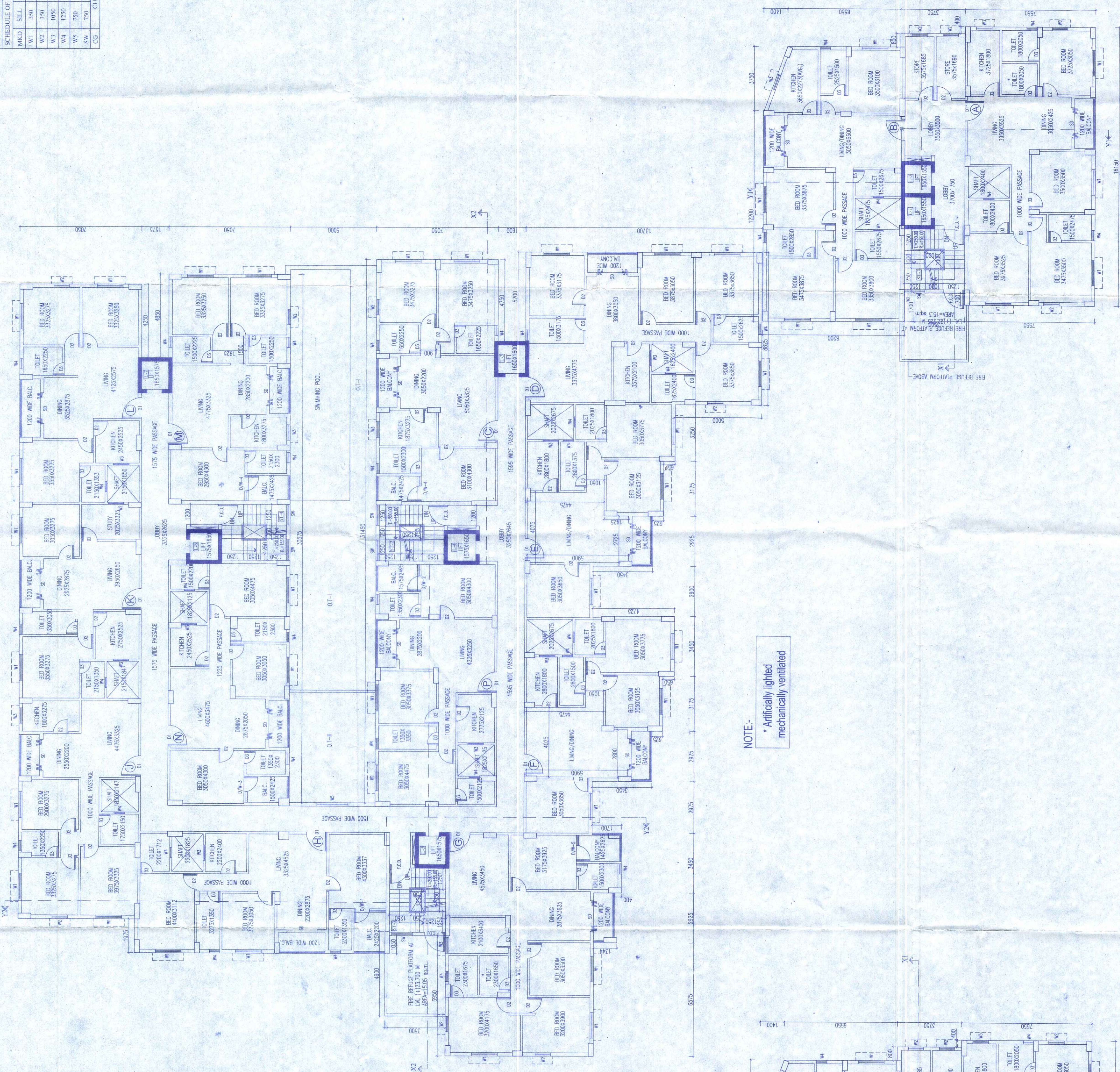
TYPICAL FLOOR PLAN (7TH FLOOR PLAN) SCALE 1:100

DR. MITA SAHA M.E. (Struct. Engg.) Licence No. 10682 (I)